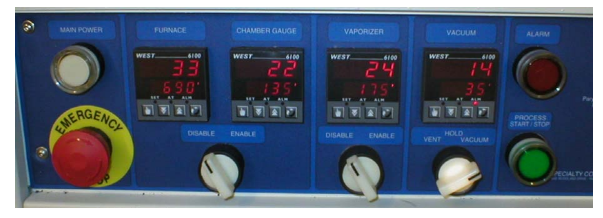
Control Panel on the Parylene Deposition System